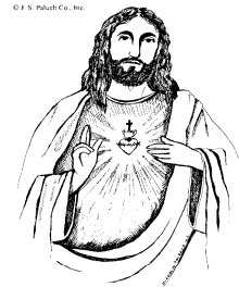
Most Sacred Heart of Jesus

Monday: 2 Cor 6:1-10; Ps 98:1, 2b, 3-4; Mt 5:38-42 Tuesday: 2 Cor 8:1-9; Ps 146:2, 5-9a; Mt 5:43-48 Wednesday: 2 Cor 9:6-11; Ps 112:1bc-4, 9; Mt 6:1-6, 16-18 Thursday: 2 Cor 11:1-11; Ps 111:1b-4, 7-8; Mt 6:7-15 Friday: Dt 7:6-11; Ps 103:1-4, 6-8, 10; 1 Jn 4:7-16; Mt 11:25-30 Saturday: Is 49:1-6; Ps 139:1-3, 13-15; Acts 13:22-26; Lk 1:57-66, 80 Sunday: Jer 20:10-13; Ps 69:8-10, 14, 17, 33-35; Rom 5:12-15; Mt 10:26-33